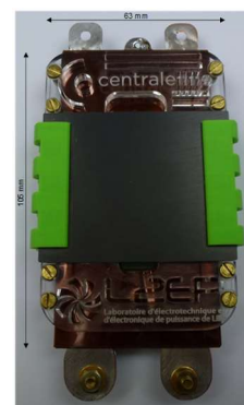
Figure 1: 2-winding planar transformer (100kHz 2.5kW)

In such applications, thermal constraints are of main concern for designers. In order to evaluate the thermal distribution inside windings and magnetic core of high frequency (HF) planar transformers a Thermal Automated Tool for Planar Magnetics (TATPM) has been developed in the L2EP. This tool enables to obtain 3D temperature distribution inside windings and core of planar transformers or inductors, in steady state or in transient case [3-5]. TATPM is a valuable support for the design of planar magnetics